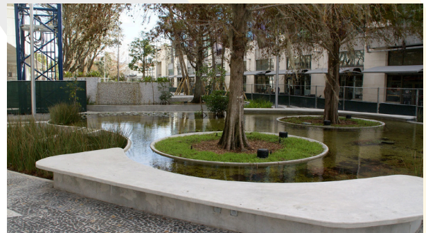
Miami Beach's Lincoln Road Mall Green Infrastructure Project

In late 2017, the Kresge Foundation committed to supporting a new three-year phase of the project in conjunction with funding directly from the compact's four counties. This new phase is focused on replicating the compact's approach throughout the United States and beyond, as well as an effort to build the capacity of the region's 109 municipalities to implement the new Regional Climate Action Plan.